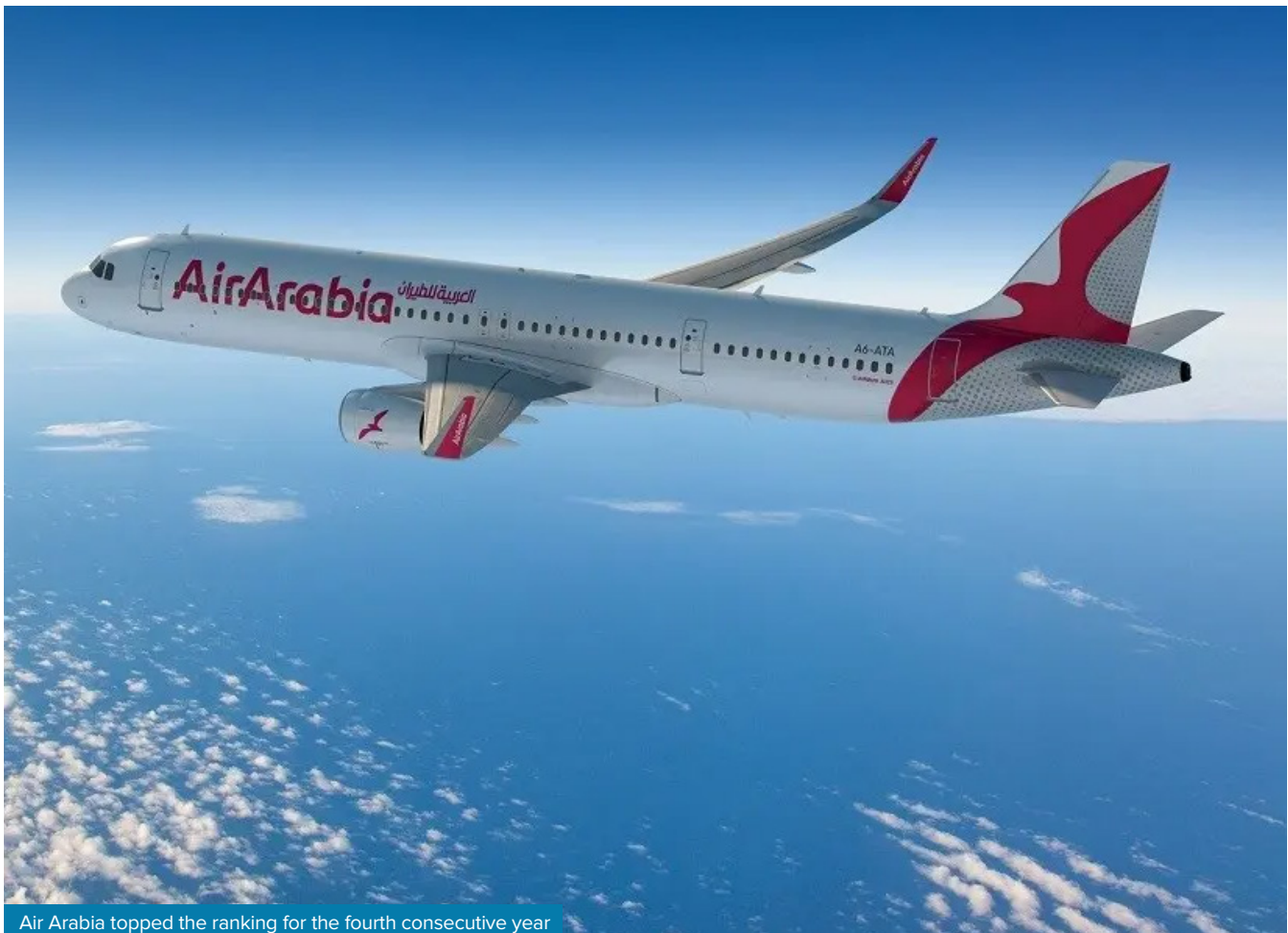
Air Arabia topped the ranking for the fourth consecutive year

In this year's report, the best performers were those airlines in countries which relaxed travel restrictions more recently, such as Japan (Skymark Airlines and Japan Airlines) and New Zealand (Air New Zealand). There was also a robust performance by leisure airlines such as Jet2, Pegasus Airlines and easyJet, which all scored well in terms of liquidity, reflecting strong forward bookings. ▲